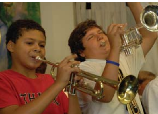
Music For All Ages Program performance at N.O. JAZZ.