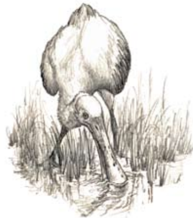
Roseate Spoonbill

Florida. The Conference, to be held at the Hilton Miami Downtown, is the largest annual forum for Everglades conservation and restoration. It brings together the Coalition's 49 ally organizations with our local, state, and federal partners. Find more conference details at www.evergladescoalition.org .