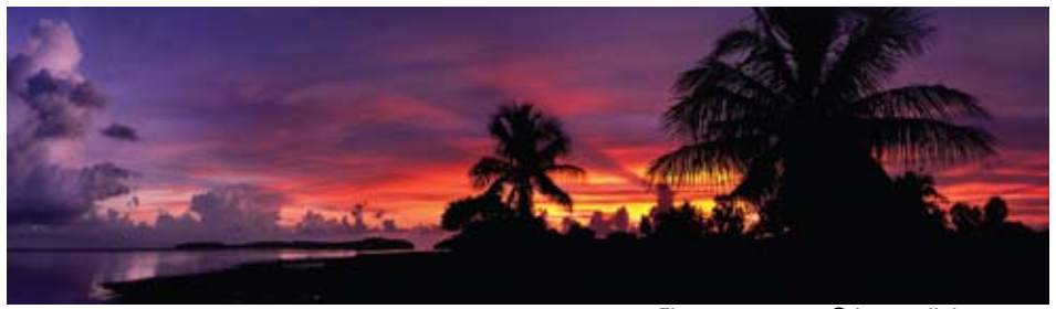
Flamingo sunset.

Leading this effort, NPCA initiated a partnership with the Urban Land Institute and the South Florida National Parks Trust to co-sponsor a Technical Advisory Panel to