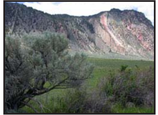
Royal Teton Ranch

Conservation groups (including the Greater Yellowstone