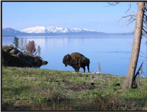
Bison in Yellowstone National Park

We believe the key to resolving the bison controversy lies in establishing areas outside of Yellowstone Park where bison — like other wildlife — can migrate at critical times of the year. This approach