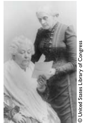
Elizabeth Cady Stanton and Susan B. Anthony

NPCA supports the Women's Rights History Project Act, a bill sponsored by U.S. Representative Louise Slaughter, which has companion legislation in the Senate sponsored by Senator Hillary Clinton. If passed, this bill would establish the Votes