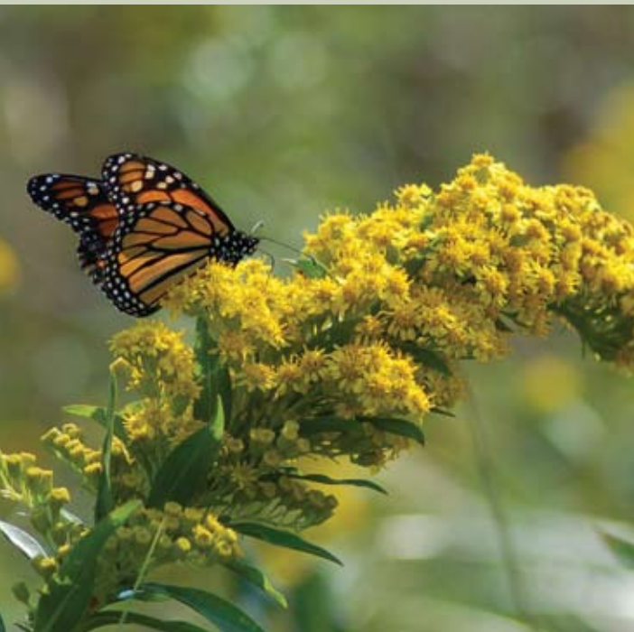
Monarch Butterfly on Goldenrod, Gateway National Recreation Area in New York City.

For more information on ParkScapes tours and on the Maine Coast Adventure , please call 800.488.4080 or go to www.npcapark.org/travel .