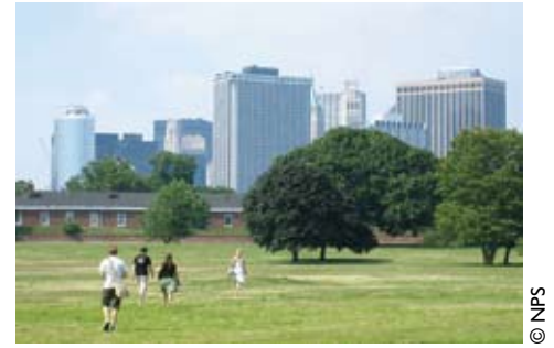
Park visitors head towards Fort Jay at Governors Island National Monument, a former military base and current national park just minutes from lower Manhattan.

Aerial view of Governors Island, located in the Inner New York Harbor.